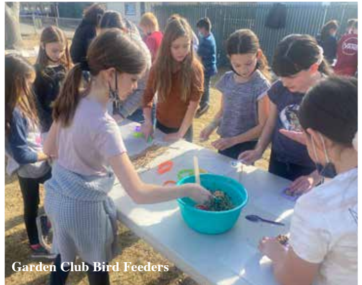
Garden Club Bird Feeders