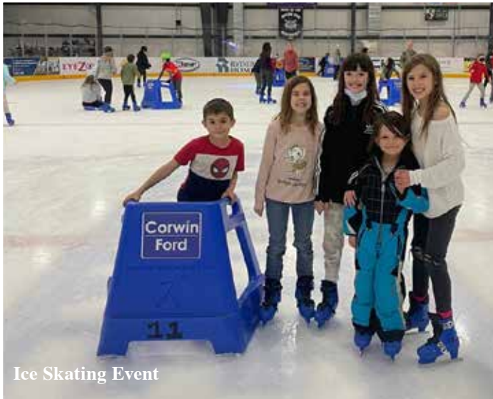
Ice Skating Event